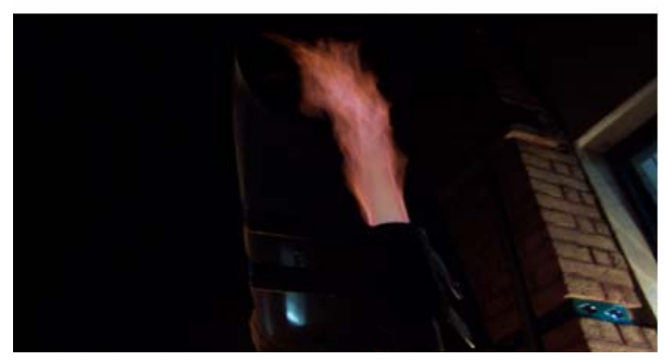
Figure 4. Picture Plate of Flare of Synthesis Gas