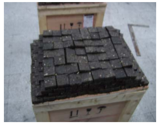
Figure 3. Pallets of MSW