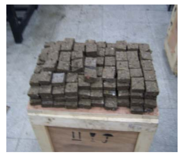
Figure 2. Pallets of FW

The pallets of FW and MSW are shown in Figures 2 &3 and the characterization of each material is given in Tables 2 to 5.